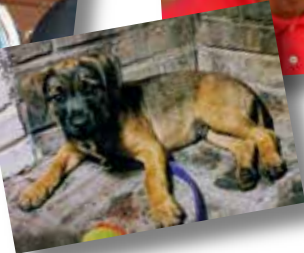
BAKU -- adopted in March of 2018. Welcome to the ABC family!